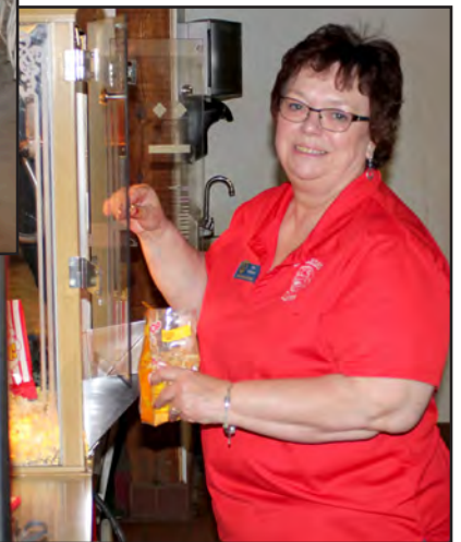
BINGO (ABOVE AND RIGHT)