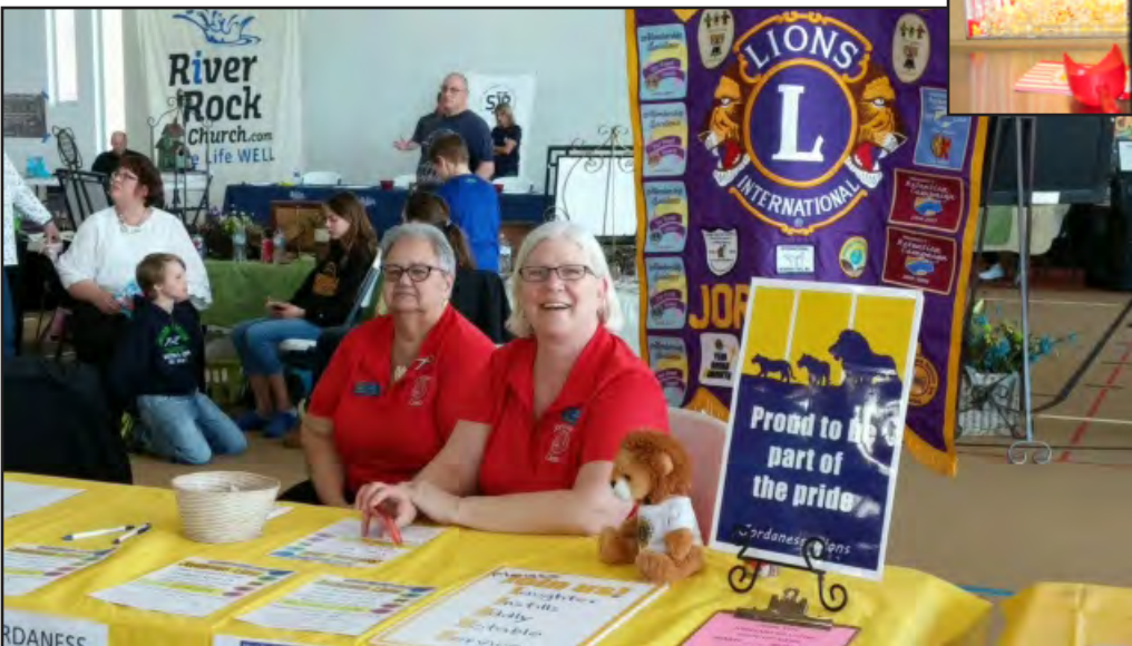
CELEBRATE JORDAN (BELOW)